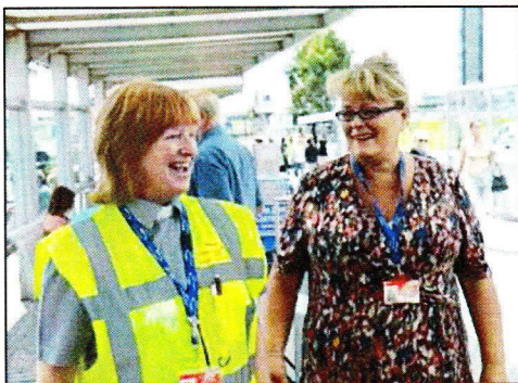
Out and about with the Terminal Duty Manager

Let us hope for a calmer and more peaceful 2016.